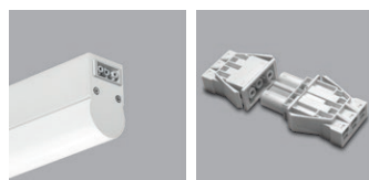
Connector for linear application

The DFR 40 is a type of luminaire suitable for various places with its slim, elegant appearance and ease of use. It is an economic model thanks to its simple design. The luminaire can be easily assembled. The connection cable does not disturb the luminaire image because it passes through the middle of the luminaire. Independent and linear applications are among the features of this luminaire.