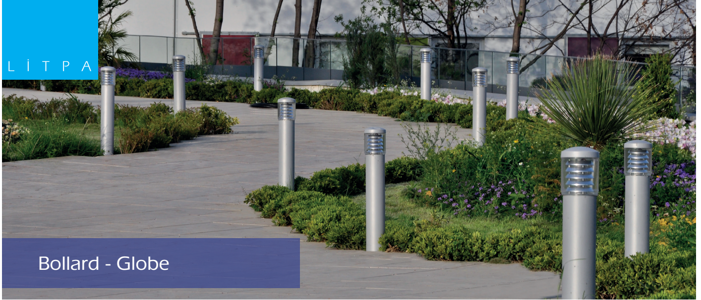
Bollard - Globe